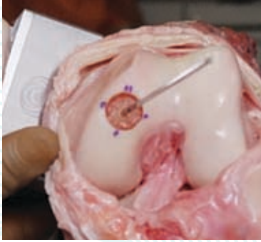
Post-identification defect, drilled Steinmann pin and advanced flat blade drill into condyle.