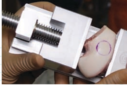
Secured allograft in vise, in same orientation as patient's exposed condyle.