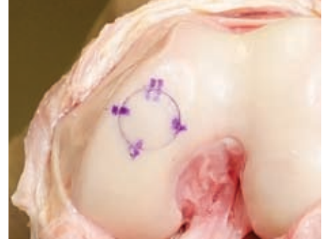
Oriented plug, advanced into recipient using press fit.

The images below compare the cell viability of an osteochondral graft with that of a patient's own knee cartilage.